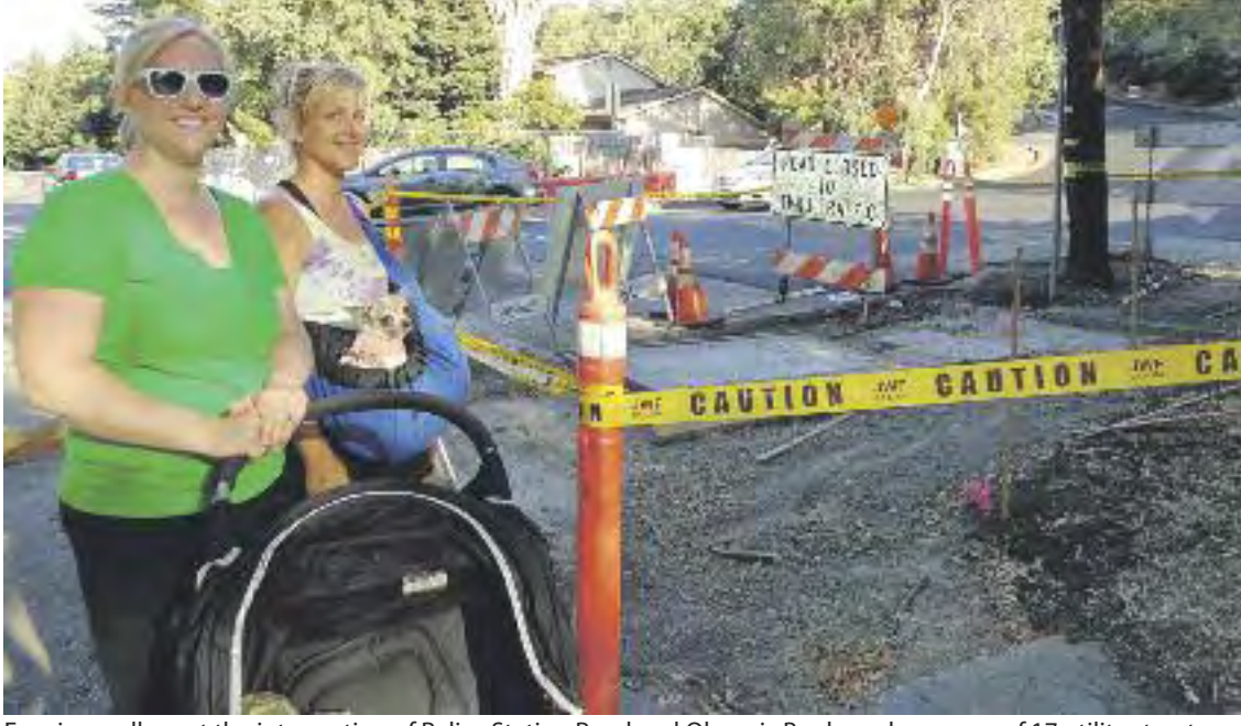
Evening walkers at the intersection of Reliez Station Road and Olympic Boulevard near one of 17 utility structures undergoing work.

Burton Valley residents aren't Olympic Boulevard, to hop on the thrilled; neither are Moraga freeway. The rerouted traffic has drivers.